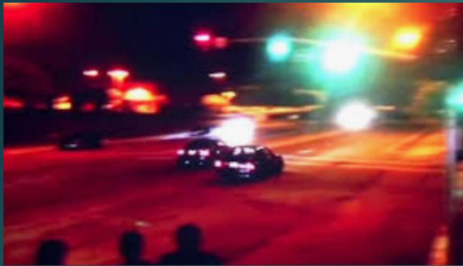
Drag Racing Cars